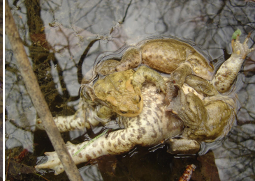
Figure 4. Bufo bufo group amplexus with Salamandra salamandra in an attempt not to drown (a) and B. bufo group amplexus with