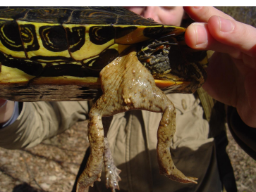
Figure 3. Bufo bufo group amplexus with Trachemys scripta (a). As a result of this wrong amplexus many individuals are being trapped inside turtle shell", suffocated, fractured and killed (b)