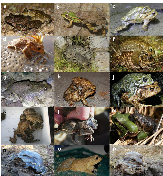
Figure 2.. Some of encountered erroneous amplexuses: (a) Pelobates cultipres x Pelophylax perezi (s gure Z., Some ol etticultered etroineus ampiexuses, (a) Perioduces curingres X Periopuris perezi (pados ineenos), (i) Bodiniam rirriegata x Pelophylax ridibundus (photo: 2mink-1), (c) Epidalea calamita x Byfo Bufo (photo: 8mink-1), (d) Bufo bufo X Ranidae ggs (photo: Martinez, N.), (e) Pelodytes (m) utiliple amplexus, (f) Epidalea calamita x Pelobates cultipres (photo: Herero D.), (g) ombina variegata x Pelodytes (h) Bufo bufo multiple amplexus x Rana temporaria (photo bonk N.), (f) Bufotes viridis x Bufo (Kolanek N.), (8). Bufor multiple x Pelophylax K. esculentus (photo Bonk N.), (f) Rana temporaria x Pelobates fuscus (photo bonk N.), (m) Pelobates fuscus x Hyla arborea (n) Rana arvalis x Pelobates fuscus (photo: Laskowski P.) (o) Bombina variegata x Bufo bufo (photo: Martinez, N.) and (p) Rana temporaria x Pelobates fucus (photo: Laskowski P.)

For now, we can say that at least 16 European species of anurans are known to make wrong amplexi (and also taking damage from), while at least 19 species are taking damage. Anuran species that have only been observed as bottom species are: Rana graceac, Pelophylox perezi and P. ridbundus. Rana graceo lives mostly in cold streams or rivers (Lymberakis et al., 2009), so encounters with other amphibian species are rare since amphibians mostly requires stagnant types of water (Vitt. & Caldwell, 2009). Pelophylax perezi and P. ridbundus are well known to make fertile hybrids so these are not taken into the consideration as wrong or unusual amplexuses. However, we expected tot of wrong amplexuses from Pelophylax species since they live in various types of habitat, lives in sympatry with other amphibian species and has a wide distribution across the Europe. Small percentage of mistakes we attributed to the fact that Pelophylax are a prolonged-breeding species, with a female that will approaches only to a calling male. Such lekking behaviour is also known to Hyla